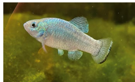
Mezquital Pupfish ( Cyprinodon meeki )

Result description: The FFSG supported the creation of Shoal's 2023 New Species Report and supported the Mekong Forgotten Fishes report and coalition, and CMS advocacy. The Alliance for Freshwater Life (AFL) was dormant in 2023, and the World Fish Migration Day (WFMD) did not take place in 2023; it has been planned for May 2024.