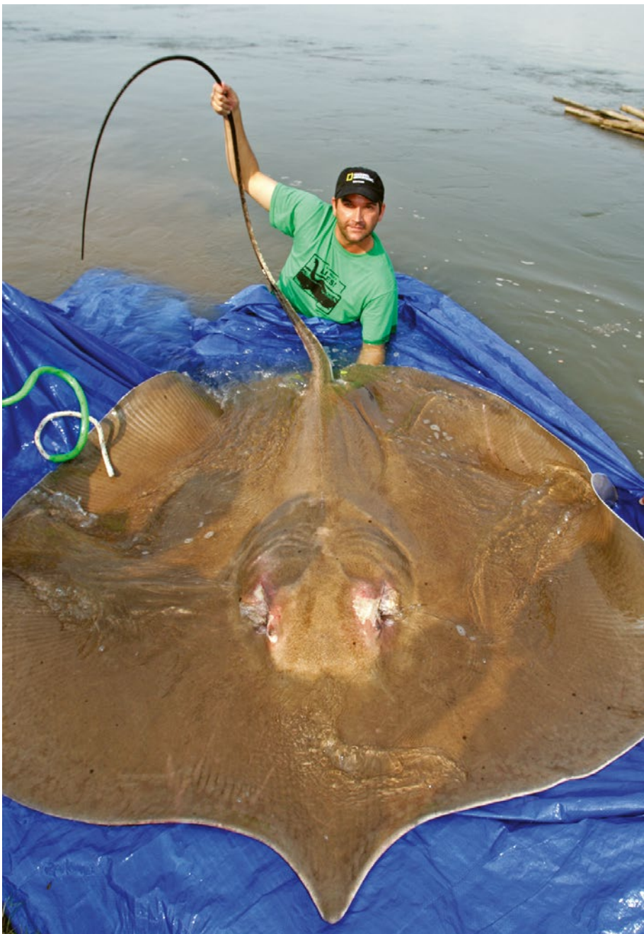
Giant Freshwater Whipray ( Urogymnus polylepis ) in the Mekong River

T-029 Contact zoos/aquaria/breeding centres working on ex situ conservation for freshwater fishes; identify contacts and add to membership. Status: On track