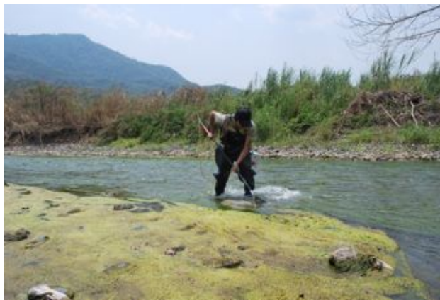
Fig. 15. Electrofisher to stun fishes