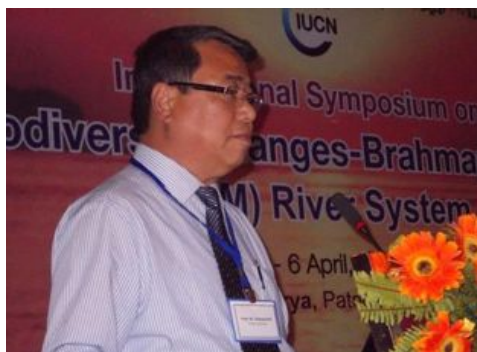
Fig. 1 GBM River symposium