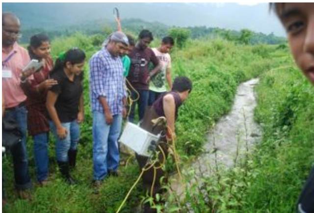
Fig. 6. Demonstration of Electrofishing