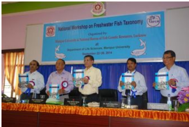
Fig. 4. Release of Fish Taxonomy Training Manual