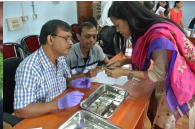
Fig. 7. Practicals on morphometry