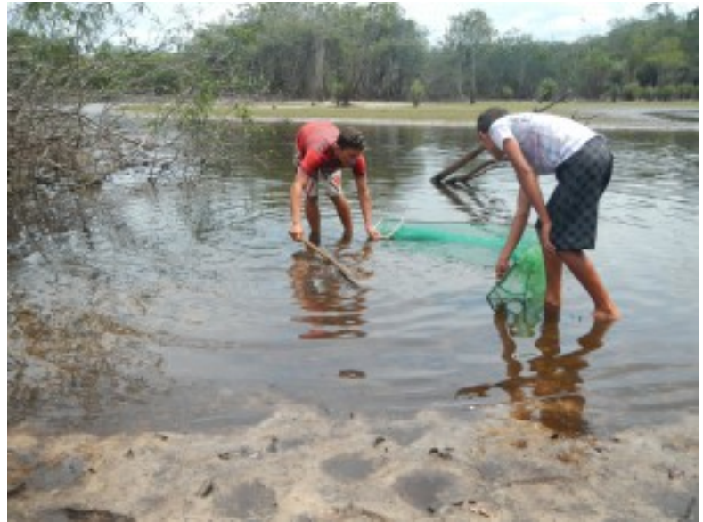
Collecting Tetras in Daracua.

HAFSG website: http://www.iucnffsg.org/about-ffsg-2/home-aquarium-fish-sub-group/