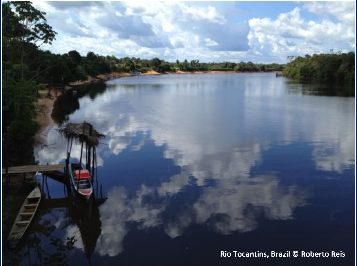
Rio Tocantins, Brazil