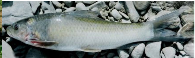
Fig. 13. Habitat loss of Bangana devdevi