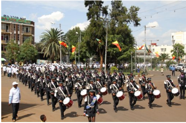
The Police March of the Amhara Regional State in Bahir Dar Town, Ethiopia. This was one of several events organized around the region to celebrate World Fish Migration Day on 24 May 2014.