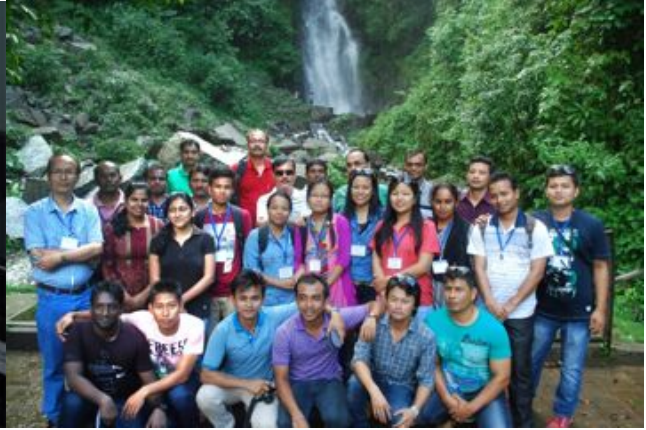
Fig. 9. The team on a Field trip