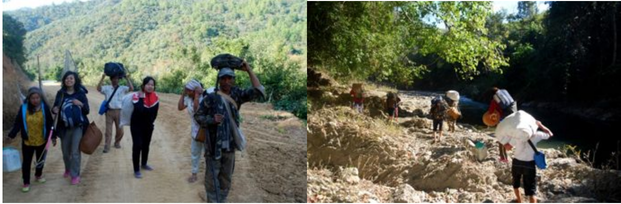
Fig. 14. Fishing team walking towards the site