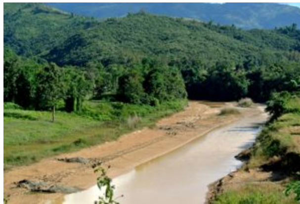
Fig. 12. Polluted Thoubal River