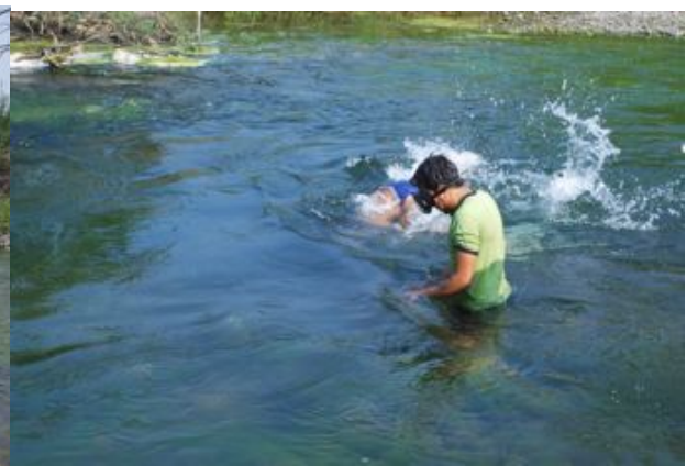
Fig. 16. Diving to collect fish