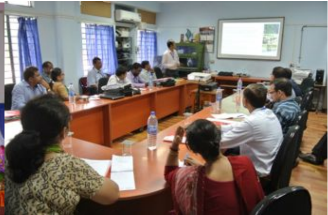
Fig. 5. Lecture by resource person