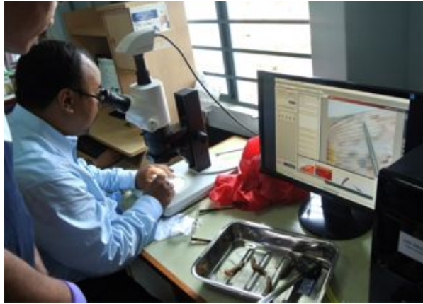
Fig. 8. Microscopy for counts & measurements