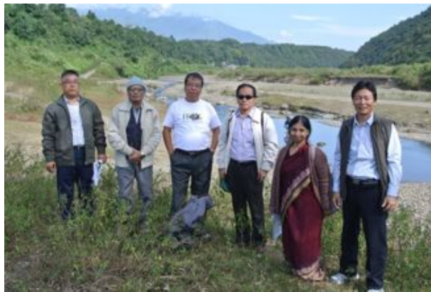
Fig. 10. Joint EIAA & SEAC on field visit