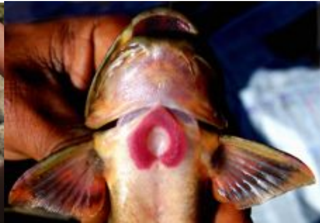
Fig. 18. Adhesive 'sucker' in live fish