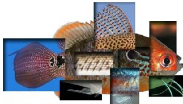
Global Freshwater Fish BioBlitz