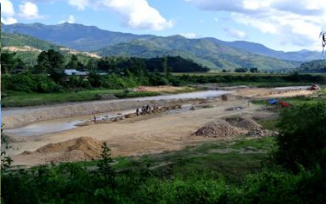
Fig. 11. Sand washing in the river