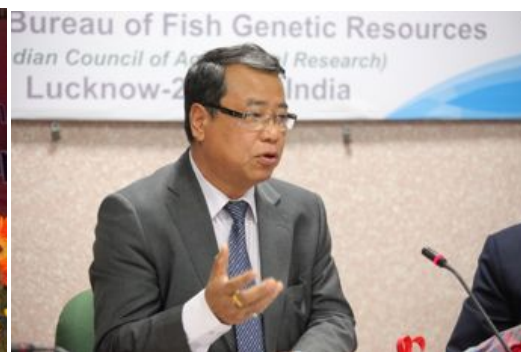
Fig. 2 Addressing the RAC Meeting, NBFGR