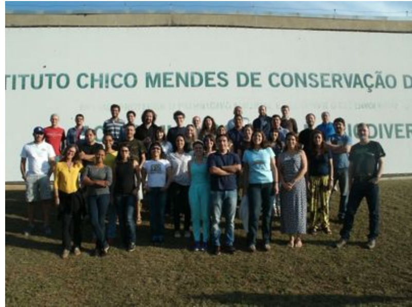
Members of the Chico Mendes Institute (ICMBio) of Brazil.

Habitat loss and degradation is by far the most important threat freshwater fishes are facing in Brazil. The results revealed that 311 (10%) of the species were assessed as threatened (102 species as Critically Endangered (CR), 110 as Endangered (EN), and 99 as Vulnerable (VU)). In addition to that, 98 ended up as Near Threatened (NT) and 381 were Data Deficient (DD), while 2,316 were regarded as Least Concern (LC). Groups particularly threatened are the annual killifishes (Rivulidae), with 125 Endangered species out of 252, and the 16 species of cave fish, all considered to be Endangered