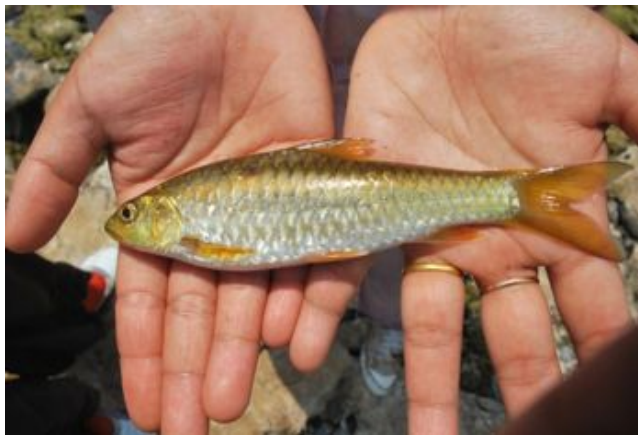
Fig. 17. Endemic carps