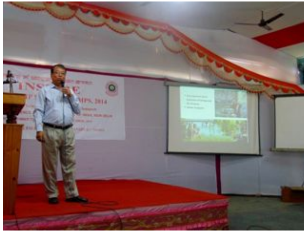
Fig. 3. Talking on Freshwater fish conservation in the Inspire Camp, October 2, 2014. For schools, attended by 250 high school students