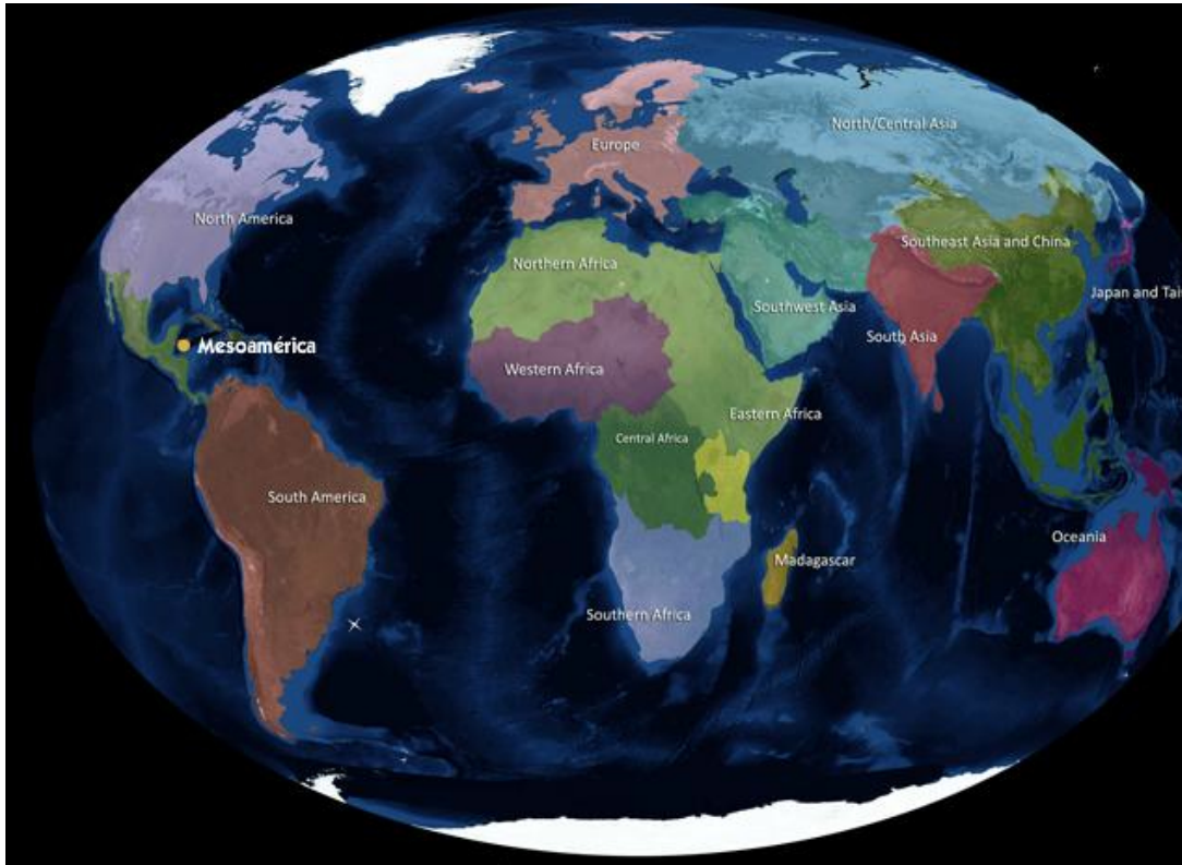
Diagram of FFSG Regions for 2013-2016 Quadrennium. Some changes will be made in 2015 due to increased membership and new regional interests.